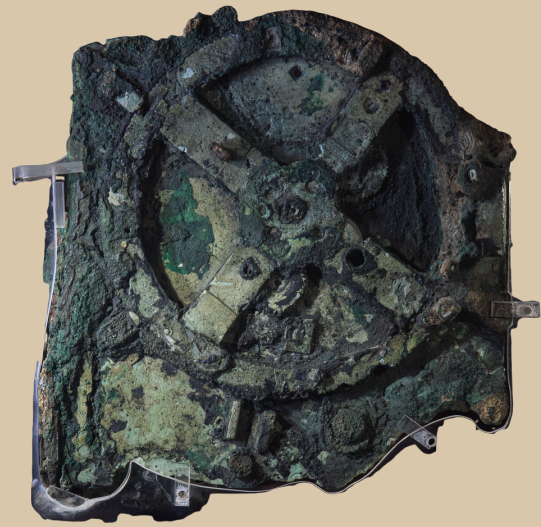
The Antikythera mechanism (fragment A) the oldest example of analogue computer (II-I century BC - Athens Archaeological Museum)

curiEUs Youth was developed in response to these challenges, bringing together cultural heritage, digital curation, and civic engagement to empower young people and youth workers across Europe.